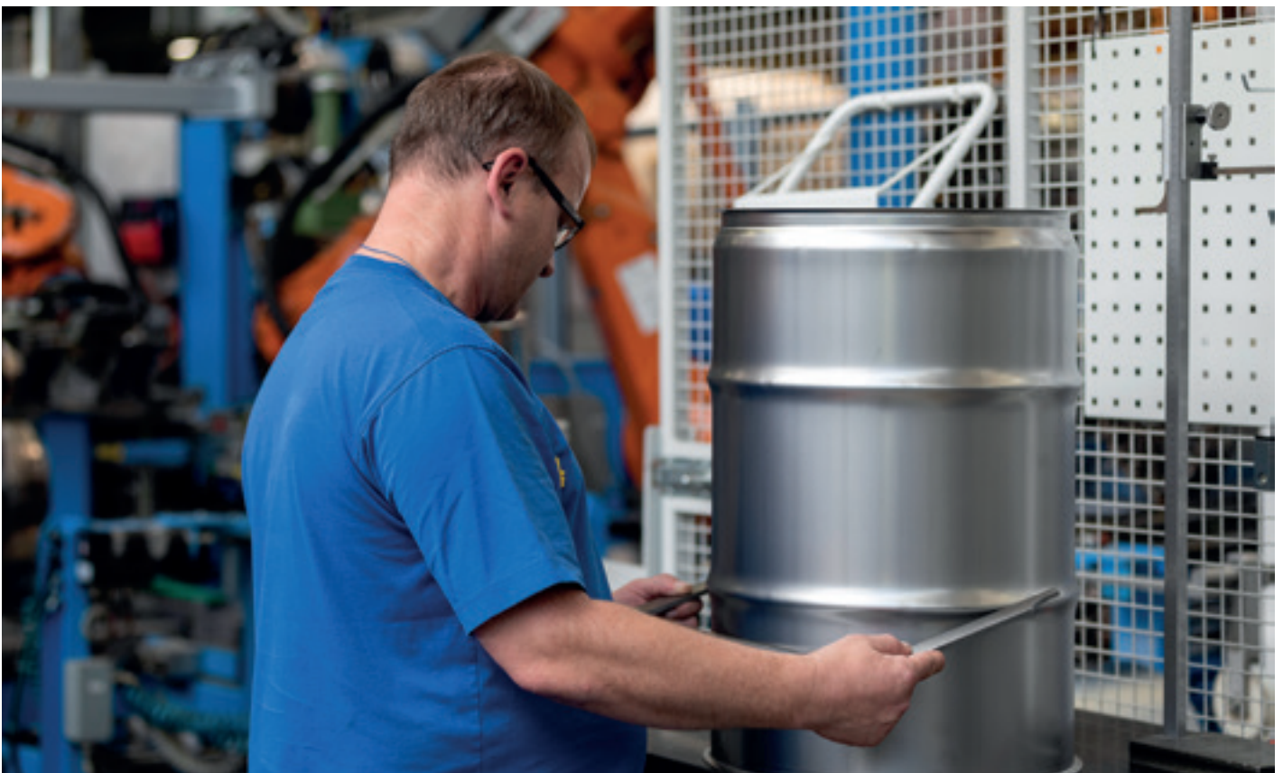
Quality control: In-process control in the production line