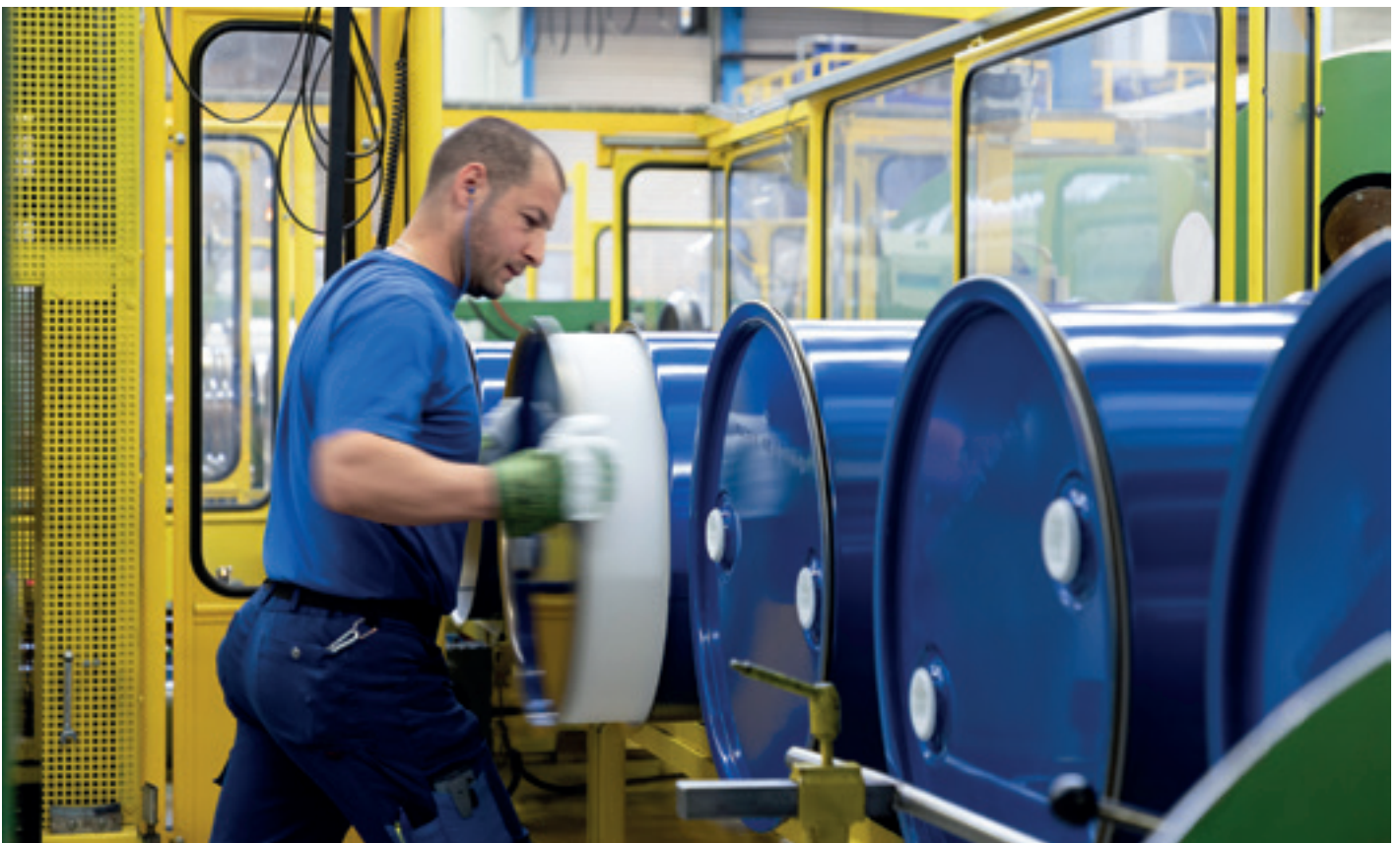
Manufacture of composite drums in the Reiden factory

The internationally oriented family enterprise with over 120 years of experience has 400 employees at production sites in Switzerland and Germany. The Group's worldwide presence is underpinned by a network of more than 50 representatives.